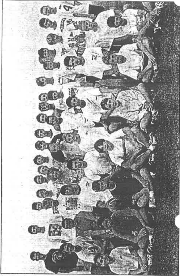
With a large group out, not to mention some talented runners, look for the Neenah boys' cross country team to keep its place among the Fox Valley Association's top teams and vie for a WIAA Division 1 state berth.